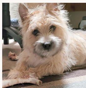
Susie Shug (foster)